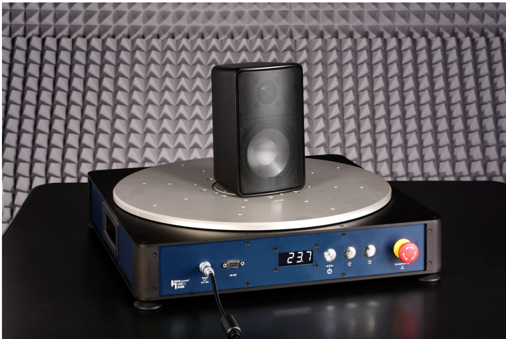
In combination with the turntable HRT I, users are able to test directivity characteristics of passive and active loudspeakers.