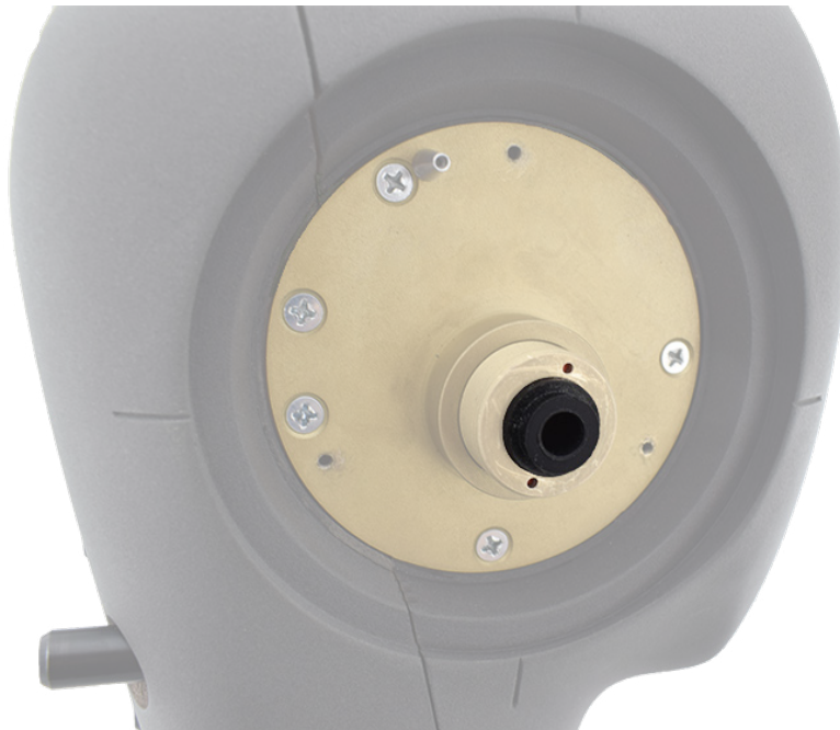
ECS I.0 in HMS II.3 with the pinna type 3.4 removed