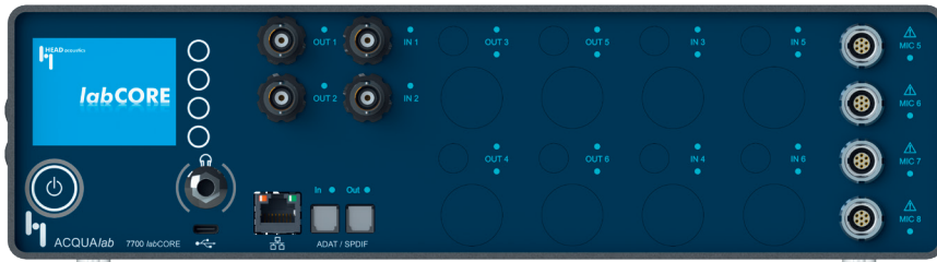
labCORE with installed coreBUS and optional hardware board coreIN-Mic4. Cutout areas, LEDs and labeling indicate the prepared positions for further boards.