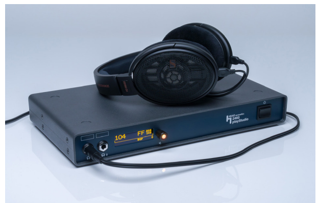
playStudio with HD OP II.1